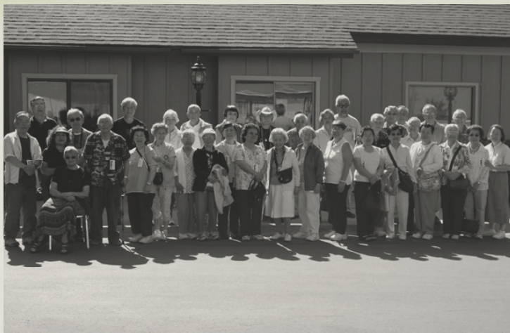
Former incarcerated Japanese Americans

To stay up to date on events and programs such as the Minidoka Pilgrimage and Mariners' Japan Night, check out our website: www.jccw.org