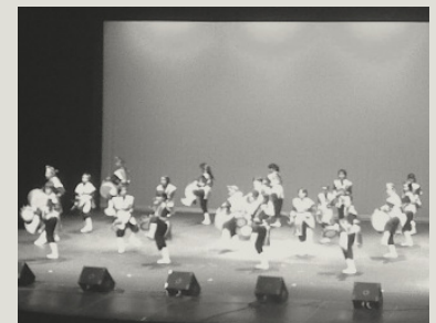
Ryuku Charm Dancers

On Saturday, July 25, the Okinawa Kenjin Kai held "Ryuku Charm," a benefit Taiko concert for JCCCW. There were incredibly talented Taiko drummers from Seattle, Canada and Japan, a salsa band from Okinawa, and many other incredible performances. With the audience at near capacity, it was a popular and successful event. The performances were unique, beautiful and inspiring. A million thanks go out to the Okinawa Kenjin Kai for supporting furthering the efforts of JCCCW. JCCCW would also like to thank all of the performing groups for donating their time to come all the way to the IKEA center to perform. Thanks to all for the incredible show.